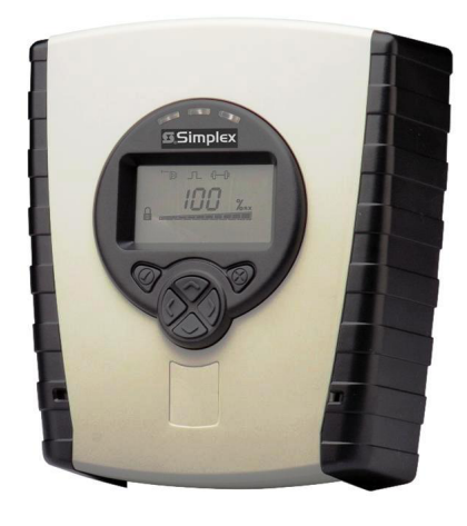
Figure 2: Addressable beam control station